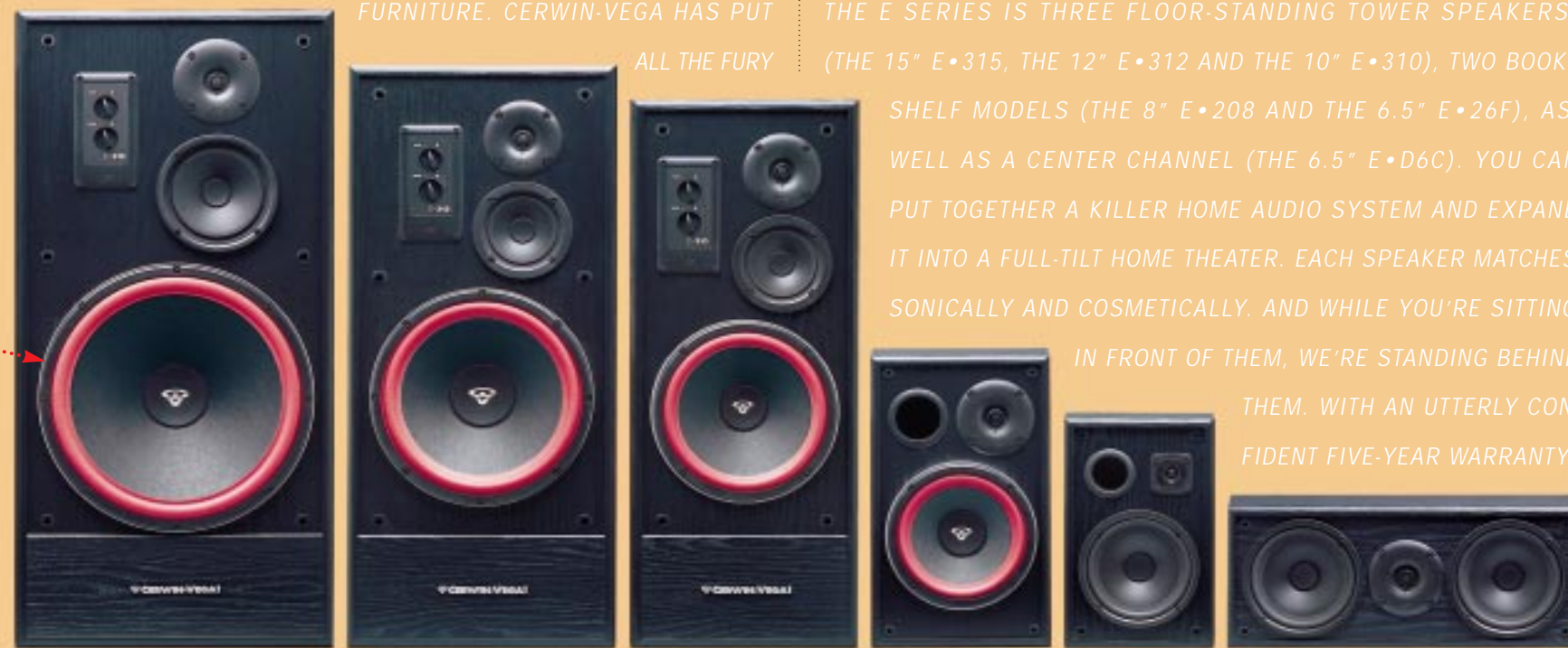
FLOOR STANDING TOWER SPEAKERS

AND PASSION OF LIVE CONCERT LOUD MUSIC INTO A BOXED SET. THE E SERIES IS THREE FLOOR-STANDING TOWER SPEAKERS (THE 15" E•315, THE 12" E•312 AND THE 10" E•310), TWO BOOK-SHELF MODELS (THE 8" E•208 AND THE 6.5" E•26F), AS WELL AS A CENTER CHANNEL (THE 6.5" E•D6C). YOU CAN PUT TOGETHER A KILLER HOME AUDIO SYSTEM AND EXPAND IT INTO A FULL-TILT HOME THEATER. EACH SPEAKER MATCHES SONICALLY AND COSMETICALLY. AND WHILE YOU'RE SITTING IN FRONT OF THEM, WE'RE STANDING BEHIND THEM. WITH AN UTTERLY CONFIDENT FIVE-YEAR WARRANTY.